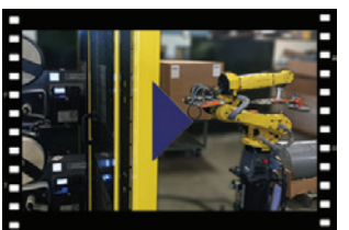
Robotic Roll Labeling

Need to handle large heavy rolls? Motion Controls Robotics has the ability to lift, upend, and package large paper, tissue, film or nonwovens rolls.