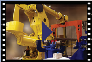
Roll Handling Overview