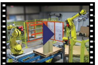
Roll Handling Teamwork