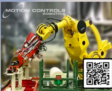
Roll Handling Playlist (20 System Videos)