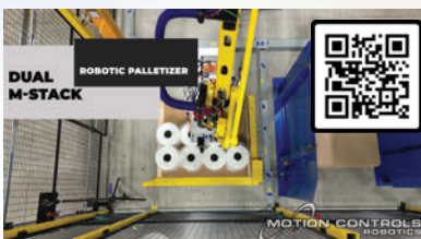
Dual M-Stack Video

The Dual M-Stack Palletizing Machine is designed to handle rolled products in a wide range of sizes. From small to large diameters, it stacks with speed and accuracy. Whether the rolls are bagged, individually wrapped, or have core plugs, this system ensures reliable and precise placement every time. The Dual M-Stack is the perfect choice for high-mix, flexible palletizing operations.