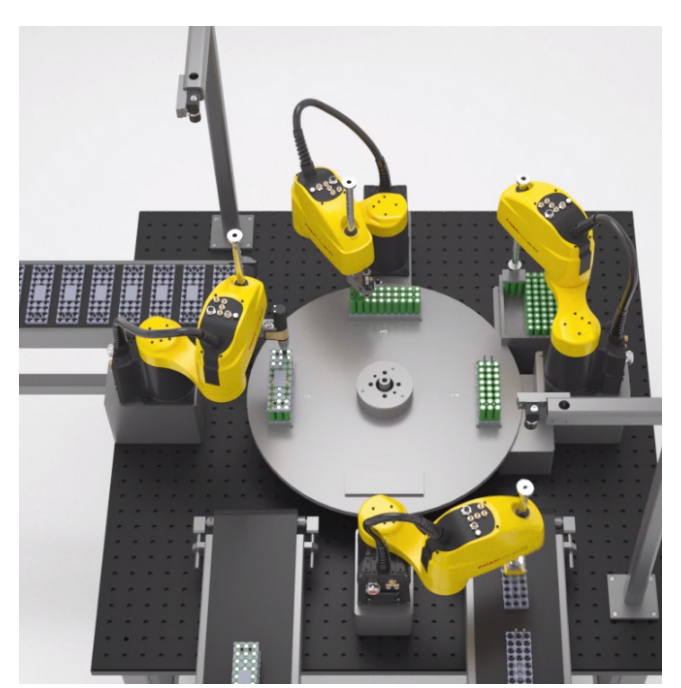
SR-3iA SCARA Robots assembling battery packs