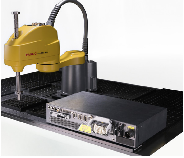
R-30iB Compact Plus controller