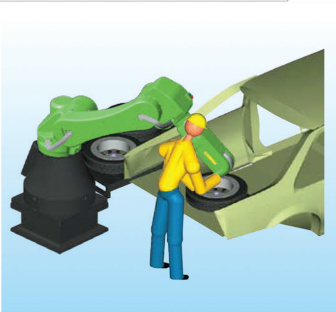
Loading spare tires into automobiles