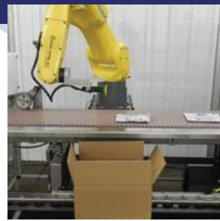
The Ergobot® case packing system includes the flexibility to park the robot while hand packing small runs of product